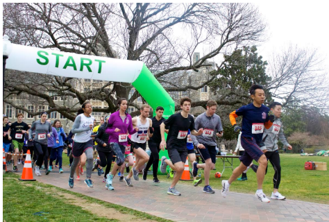
Georgetown 5k Race Against Homelessness

On March 26, hundreds of runners, walkers, and supporters gathered on the historic campus of Georgetown University for the 2017 Georgetown 5k Race Against Homelessness.