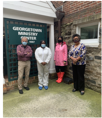
DC Councilmember, Brooke Pinto, visits Drop in Center